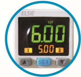
▲ Electronic Pressure Sensor